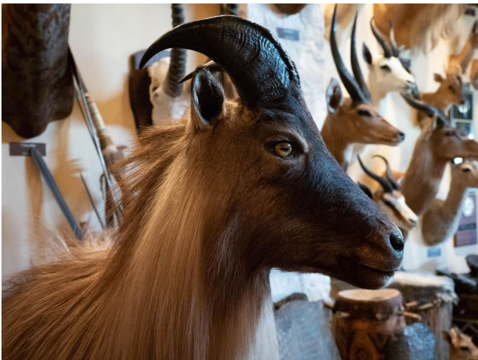
Trophy room scenes were filmed at the ranch of former Texas House Speaker Gib Lewis